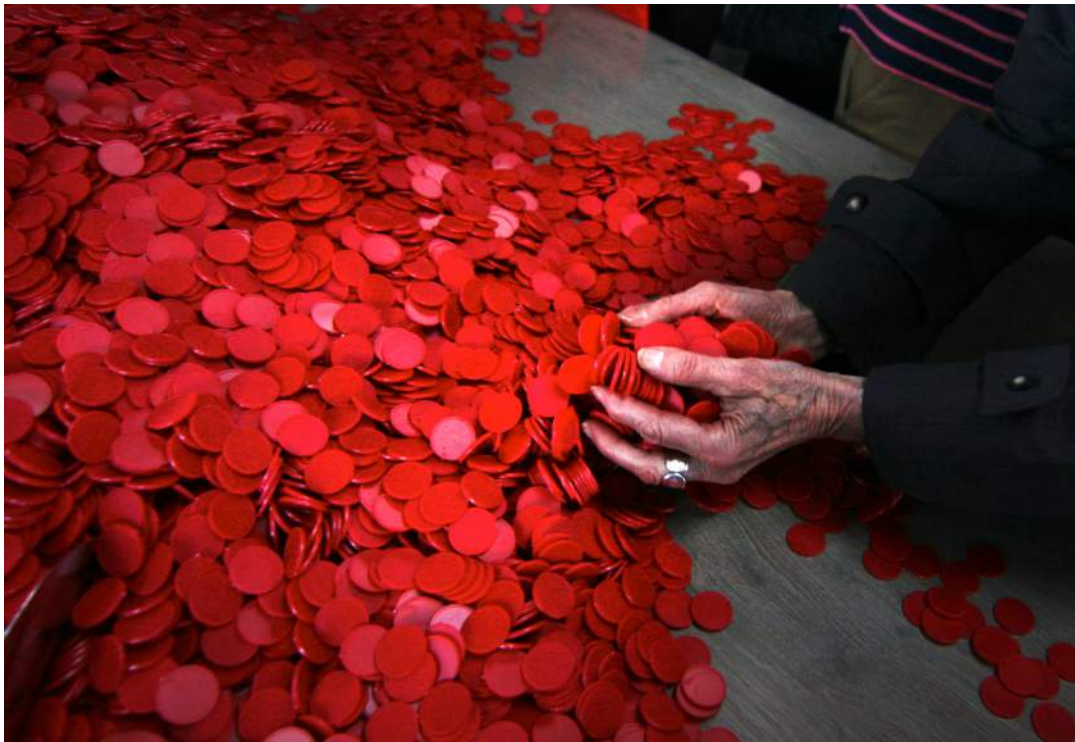
Conference Participants symbolically 'Moving the Money' from military to social spending

In 1915 the women gathered in The Hague saw “in the private profits accruing from the great armament factories a powerful hindrance to the abolition of war.” 100 years later we can see that as long as war is profitable, the killing will continue. Those profiting from the production of arms maintain the system of war. They have turned militarism into a way of thinking about, responding to, and investing in the world. The default response to challenges has become military intervention. International law has been subordinated and the UN marginalised.