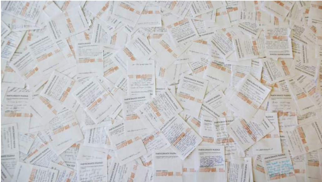
Pledges of Commitment to the Movement made by Participants at the Conference

The three-day conference included five plenary sessions 48 breakout sessions, a manifestation, a marketplace, an anniversary festival, as well as a number of exhibitions, all telling and showing the history of WILPF. Elements from all of these discussions are captured in this overall outcome document, which is organised into two main sections to reflect some of the broad themes covered by the conference. The first explores and challenges root causes of conflict and gendered power in the world, including patriarchy, capitalism, racism, and militarism. The second focuses on strengthening the social movement for peace through concrete commitments for action.