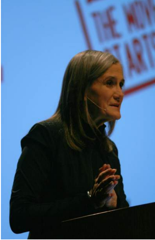
Amy Goodman on independent media